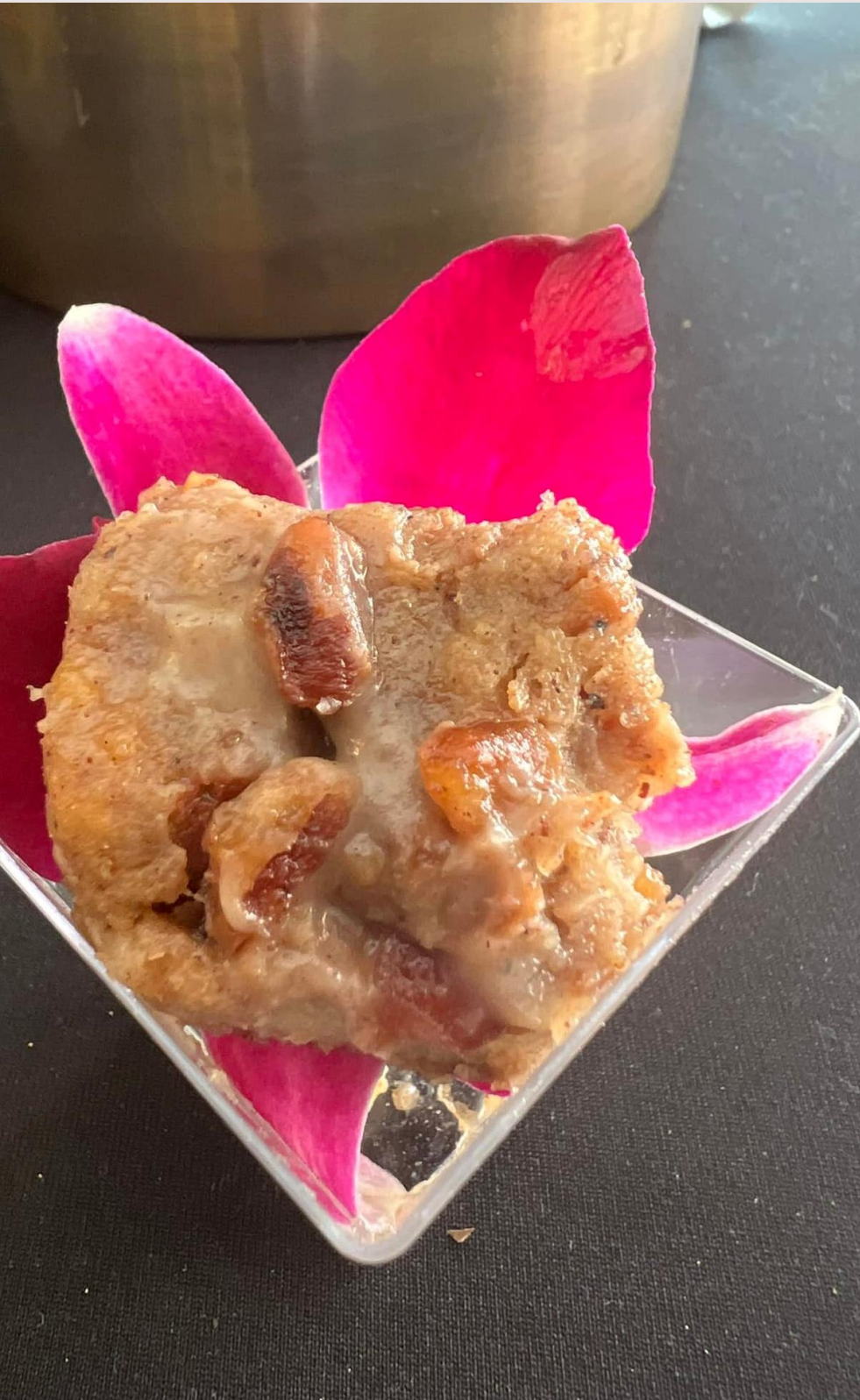
Peach cobbler parfait